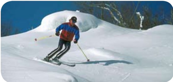
Skiing at Sugar Mountain

Tweetsie Railroad - North Carolina's first theme park. Relive the Old West aboard the historic steam-powered locomotive known as Tweetsie. Bring your family and enjoy entertaining shows, rides, shopping, mountain clogging, panning for gold and a deer park. Open 9AM-6PM Friday-Sunday in May. Memorial Day through Mid-August open seven days a week from 9AM-6PM. Mid-August through October open Friday-Sunday from 9AM-6PM. Located on Hwy 321 between Boone and Blowing Rock, NC. and from the Blue Ridge Parkway exit at mile post 291, Boone exit. For more information call (800) 526-5740 or visit our web site: www.tweetsie.com .