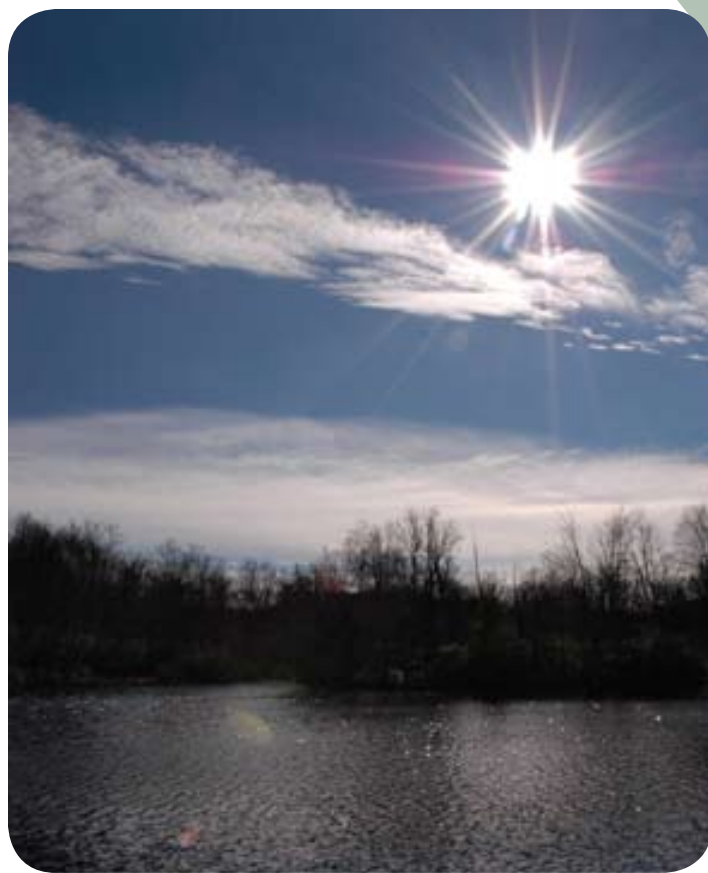
Price Lake Sun Burst

305.2 Junction Parkway and US 221 . 3 mi. west to Linville.