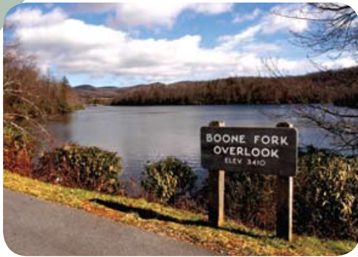
Boone Fork Overlook Price Lake

291.9 US 221/321 Crossover. 7 mi. north to Boone, 2 mi. south to Blowing Rock.