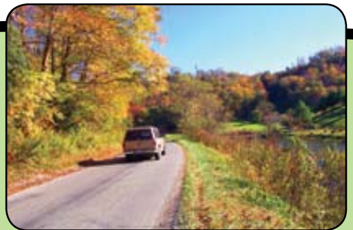
Boone, NC Exit at Milepost 291.9

Here in the highest part of the Appalachian mountains, Daniel Boone once explored mountain trails.