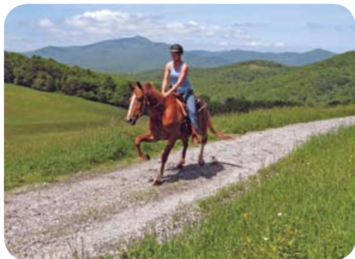
Moses Cone Park

Inn at Yonahlossee Resort - Between MP 294 & 295. Just 2.5 miles off Parkway on Shulls Mill Road. Intimate rooms, cozy cottages, and luxurious homes. Indoor & outdoor tennis, equestrian center, indoor pool, fitness center with sauna. Fine dining at The Gamekeeper Restaurant. www.yonahlossee.com . (800) 962-1986.