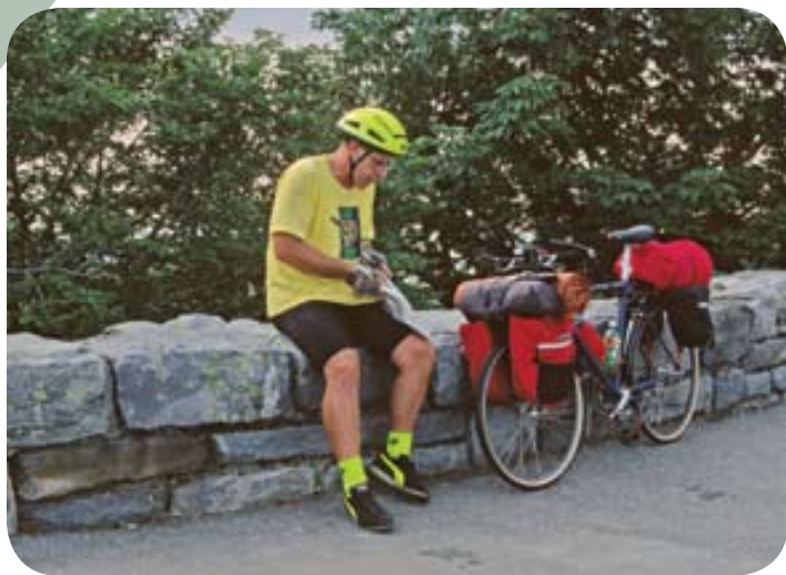
Bicyclists enjoy the ride and the views

KOA Kampground - From Boone, 194N 3 mi. Left on Ray Brown Rd. 1 mi. Beautiful view. Rec room, mini-golf, laundry, pool. 123 Harmony Mtn. Lane, Boone, NC 28607. (828) 264-7250.