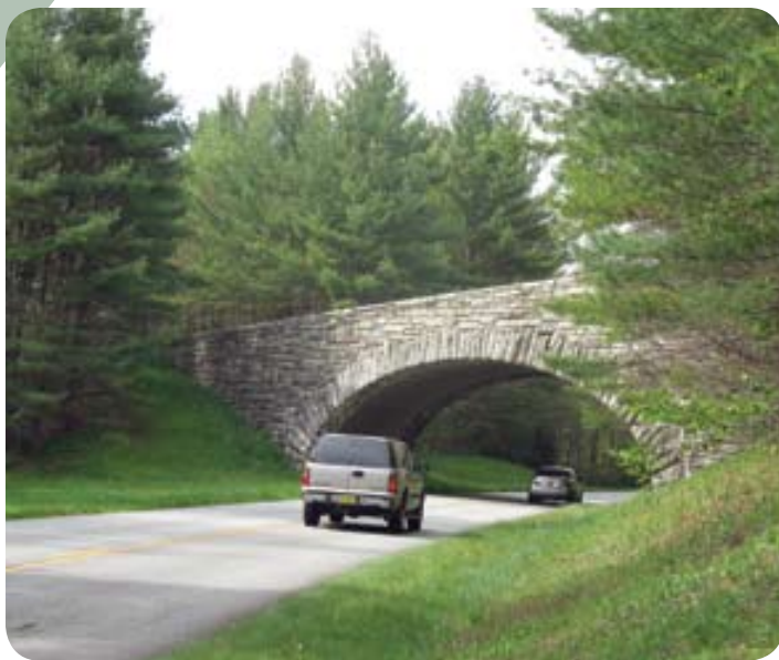
Avery County, Hwy 181